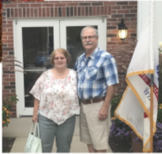
Guests arrived, ready to bid in the silent auction, purchase 50/50 raffle tickets and have a great steak & chicken dinner!