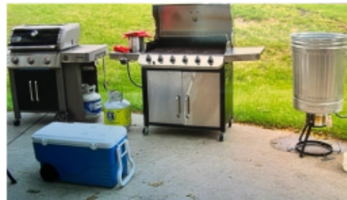
The grills are ready to go!

We had a great selection of silent auction items ranging from cigars to Brewers tickets to a hand-made lap quilt.