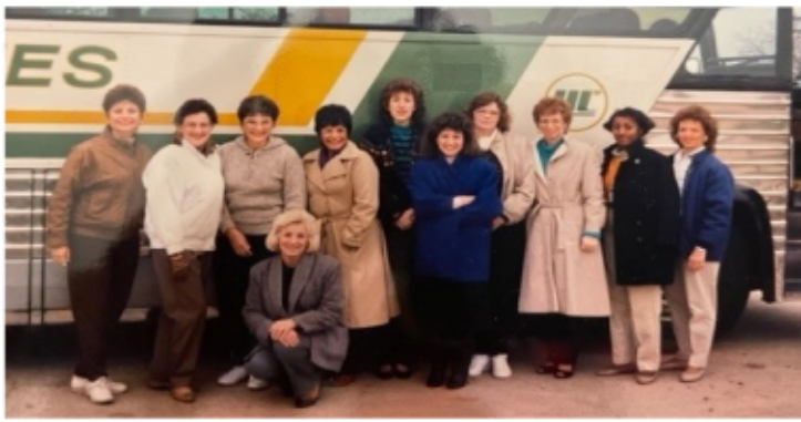
Family Support Group headed to Great Lakes for a shopping trip in 1989!