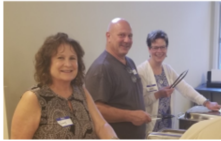
The food was served with smiles!