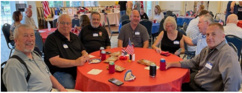
The 5091st was well-represented.