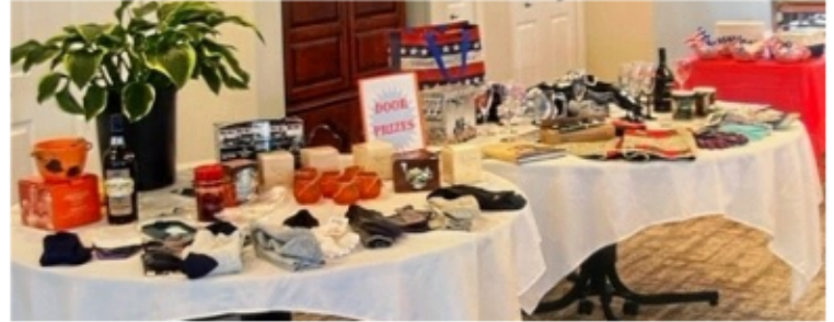
The Door Prize table was filled with an assortment of donations—this picture was taken before many items were displayed!